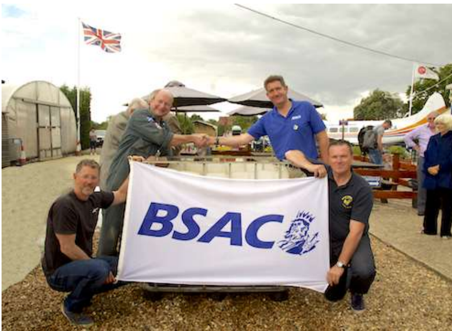
Handing over the second Bomb to the deHavilland Museum yesterday.

Our plan is now to do two Highball presentations on Wednesday's in August, one on the 16th August and another on 30th August. These are the two dates for "open night" at the club where people will have the opportunity to see the Highball Bomb before it leaves to go to the Barnes Wallace Collection at the Brooklands Museum and hear about the history of the bombs and the story of the expedition to recover them. All are welcome, friends and family as well. Our bar will be open and there will be free food. ECSAC Members are invited to attend for free, other attendees are being asked for a donation of £5 which covers entry and food provided on the night. Proceeds from the donations will be put towards the costs of restoring the bomb prior to it being donated to the Barnes Wallace collection at Brooklands Museum later this year. If ECSAC members want to make a donation on the night then they are of course welcome.