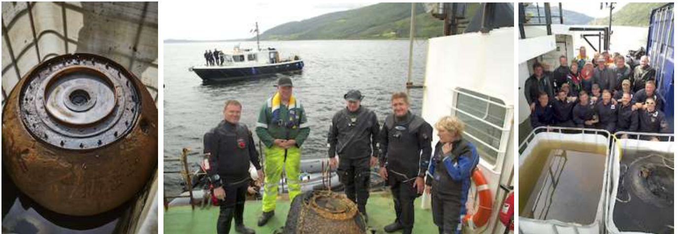
Bomb on the left, Some of the ECSAC recovery team with the recovered bomb destined for the deHavilland Museum and the entire Highball BSAC and Navy Dive Teams with both bombs.

All in all a superb adventurous expedition with great support from the Navy, Serco (Naval Support), Aspect Surveys, Seamap Ltd and Subsea Surveys ROV.